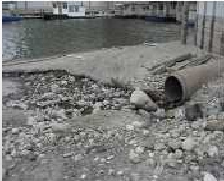
3 rd Street Boat Launch