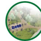
U1 U2 GONZAGA SOUTH CAMPUS ENTRY