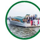
U2 U1 UPRIVER ELECTRIC BOAT CRUISE/TAXI