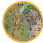
G2 KENDALL YARDS PRIORITY PROJECT OVERLOOK OR HIGH BRIDGE MP