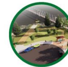
U3 U3 IRON BRIDGE RIVER PUT-IN