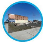
F1 WEST GATEWAY OPPORTUNITIES