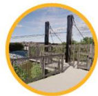
G3 GORGE ZIP LINE