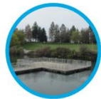
F3 EAST GATEWAY/ FLOATING STAGE