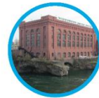
F2 AVISTA POWER STATION AND DAM TOURS: INTERPRETIVE SITES