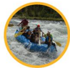
G1 G3 WHITEWATER EXPERIENCE