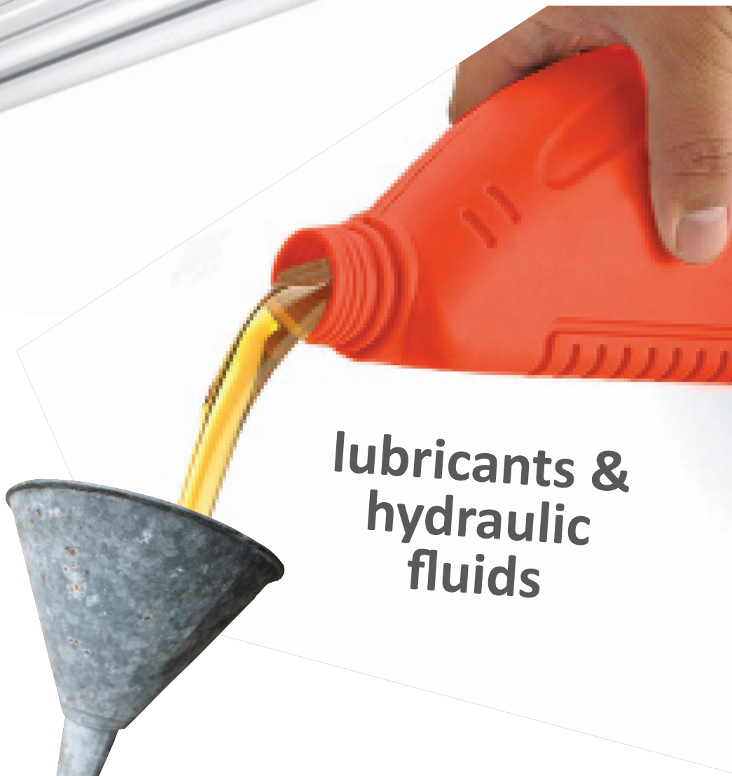
lubricants & hydraulic fluids