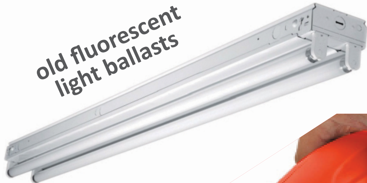
old fluorescent light ballasts