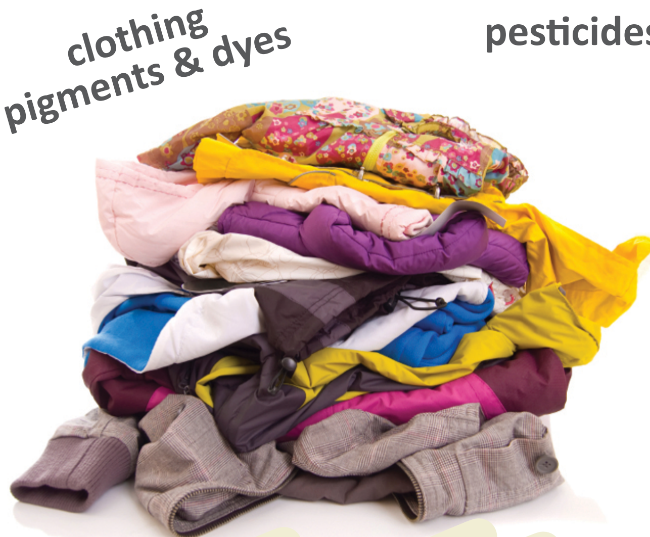
clothing pigments & dyes