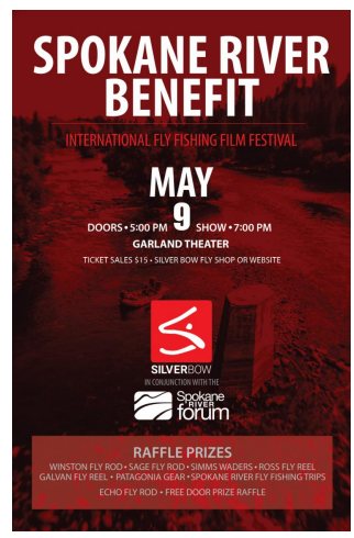
Click Image to Buy Tickets Today!